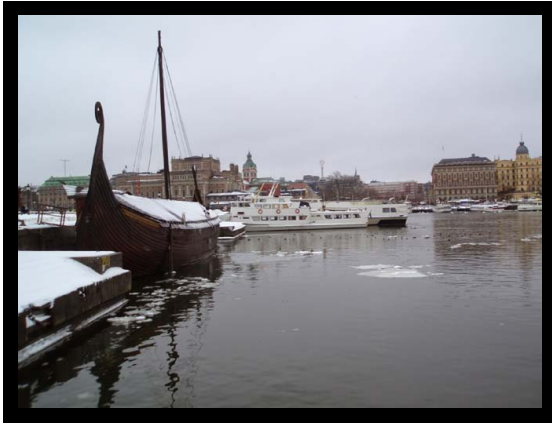
Stari Grad in January 2005-my first day back from Christmas break in Canada. A rare snowfall made everything feel different.