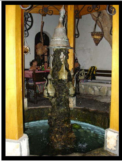
At night the old town picks up a charm and ambience that leave you feeling you are in a fairytale.