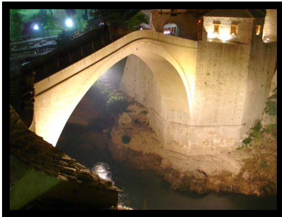
Phil's eye for lighting captures moods and textures of Mostar...