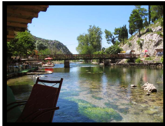
Lunch at the source of the river Buna