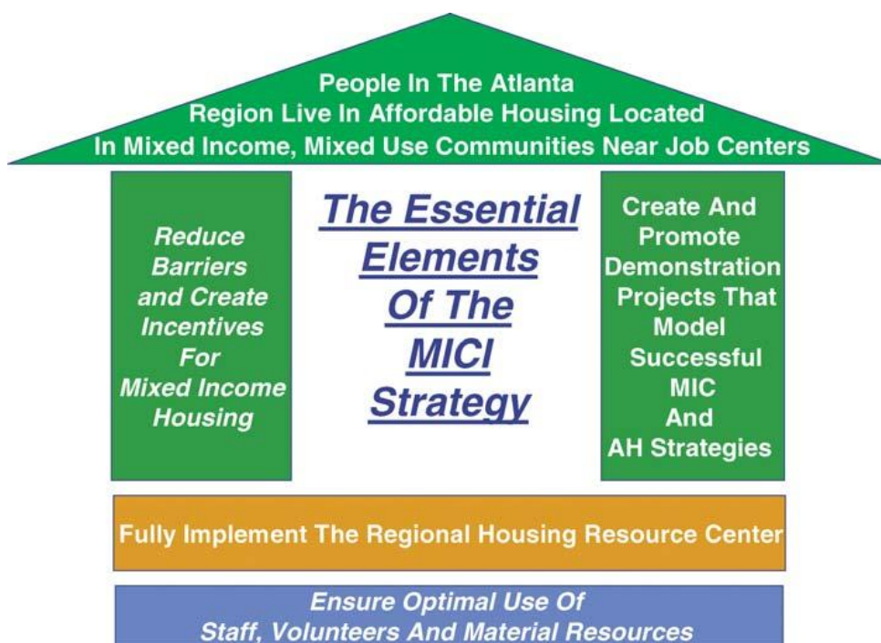
FIGURE 2 MICI's Theory of Change

come people, as a subset of the larger market for housing in the metro Atlanta area. At the outset, the MICI Committee and the ANDP board of directors expected that a cost benefit analysis could be conducted by tabulating changes in the availability of mixed-income housing, as specified in the initial grant proposal. As the MICI Committee began to work through this model during the formative stage of PE, the number, range and potential interactions of the numerous factors (e.g., political will, economic incentives, legal and policy constraints and imperatives), combined with complex and occasionally unknowable costs, suggested that cost benefit analysis did not tell the whole story. As a result, MICI Committee members and staff extended their initial list of outcomes (e.g., physical assets) to include less tangible outcomes (e.g., intellectual assets and leadership assets) that advanced the funder's strategy. This is a prime example of how PE can clarify the meaning and measurability of outcomes in a complex environment.